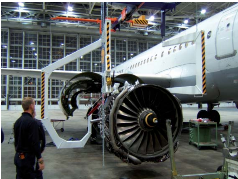
Engine Change Sling A320

The engine is attached to three points, two at the fan case and one at the turbine case. The rear C-beam is rotatable to both sides to use the sling on left and right side engines. Also the engine can be rolled and moved, nose up and down. To use this sling an overhead crane is needed with slow drive speed and with a loading capacity corresponding to the engine types.