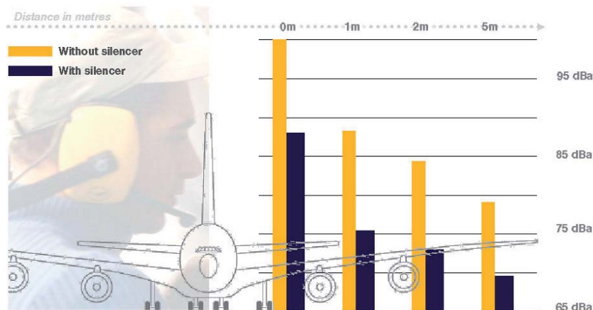
B737 / B747-200

Test-runs at Lufthansa LEOS have shown an improvement of up to 12,8 dBa. A reduction of 10 dBa already means a decrease of the noise by 50 per cent.